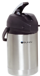
AIRPOT, 2.5L SST LA SINGLE PK